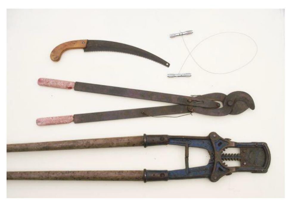
Image 2 – Instruments used for tipping the horns of adult livestock

NOTE: Read and follow the manufacturers label for correct and safe use.