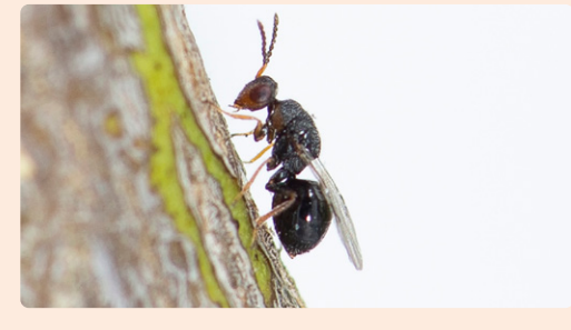
Citrus gall wasp

• If there are small holes on the gall, then adults have already emerged.