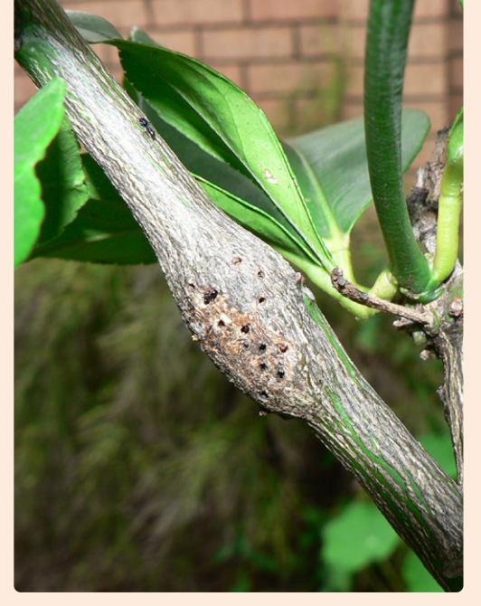
Citrus gall wasp exit holes