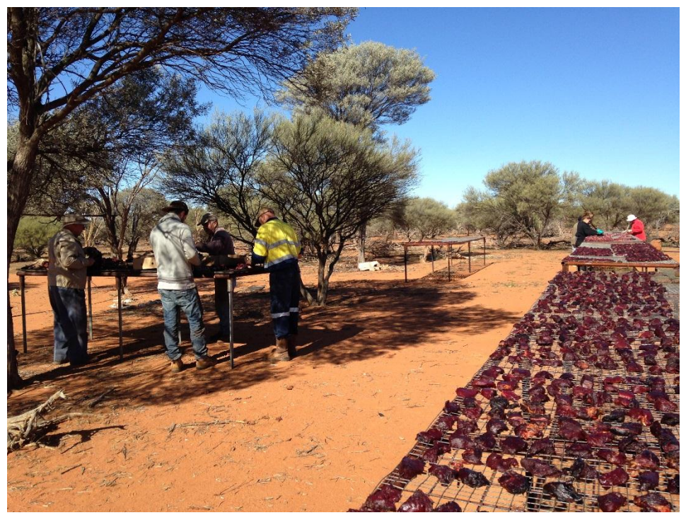
Melangata Bait Rack May 2015

The MRBA community baiting program operates on the basis that a co-ordinated approach, where all pastoralists lay baits within the same time frame, is a fundamental component of a successful wild dog reduction program. Further details of the community baiting program are available in the MRBA Wild Dog Management Plan.