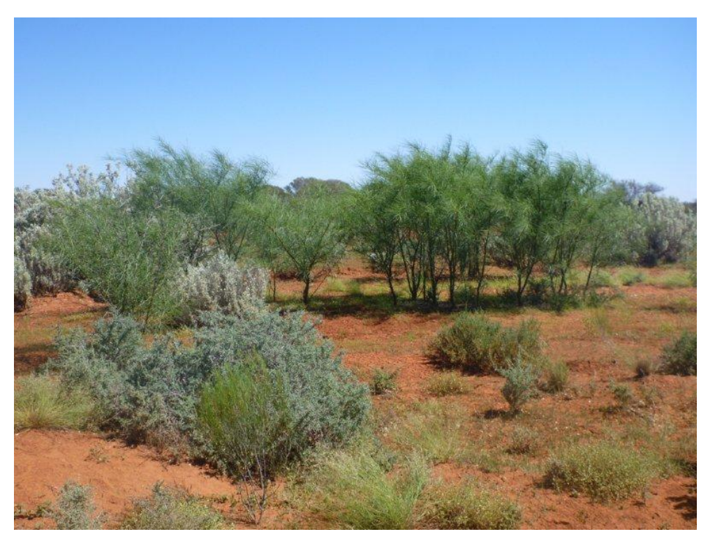
Parkinsonia aculeate - Windimurra Station March 2015

term and over the next three years. Whilst it is too early to determine the effectiveness of the treatment early signs are encouraging.