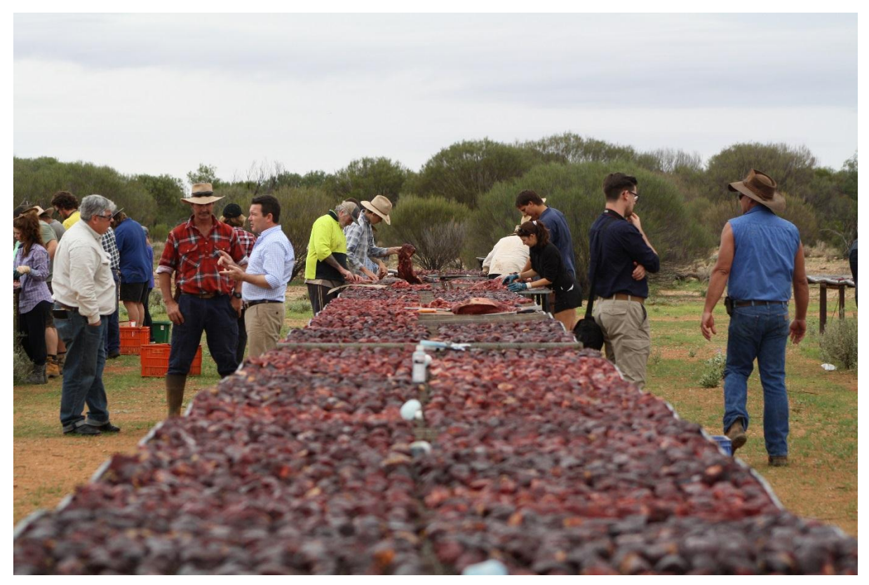
Senator Dean Smith – Challa Bait Racks April 2015

some $4.8 M. Once completed the cell will enclose an area of 88,000 km<sup>2</sup>, helping to protect some 55 pastoral stations and 9 Department of Parks and Wildlife properties.