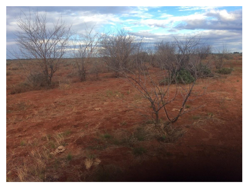
Dead Parkinsonia aculeate - Windimurra Station May 2016.