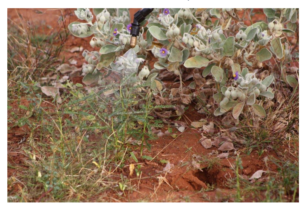
Spraying of Parkinsonia aculeate seed sets - May 2016