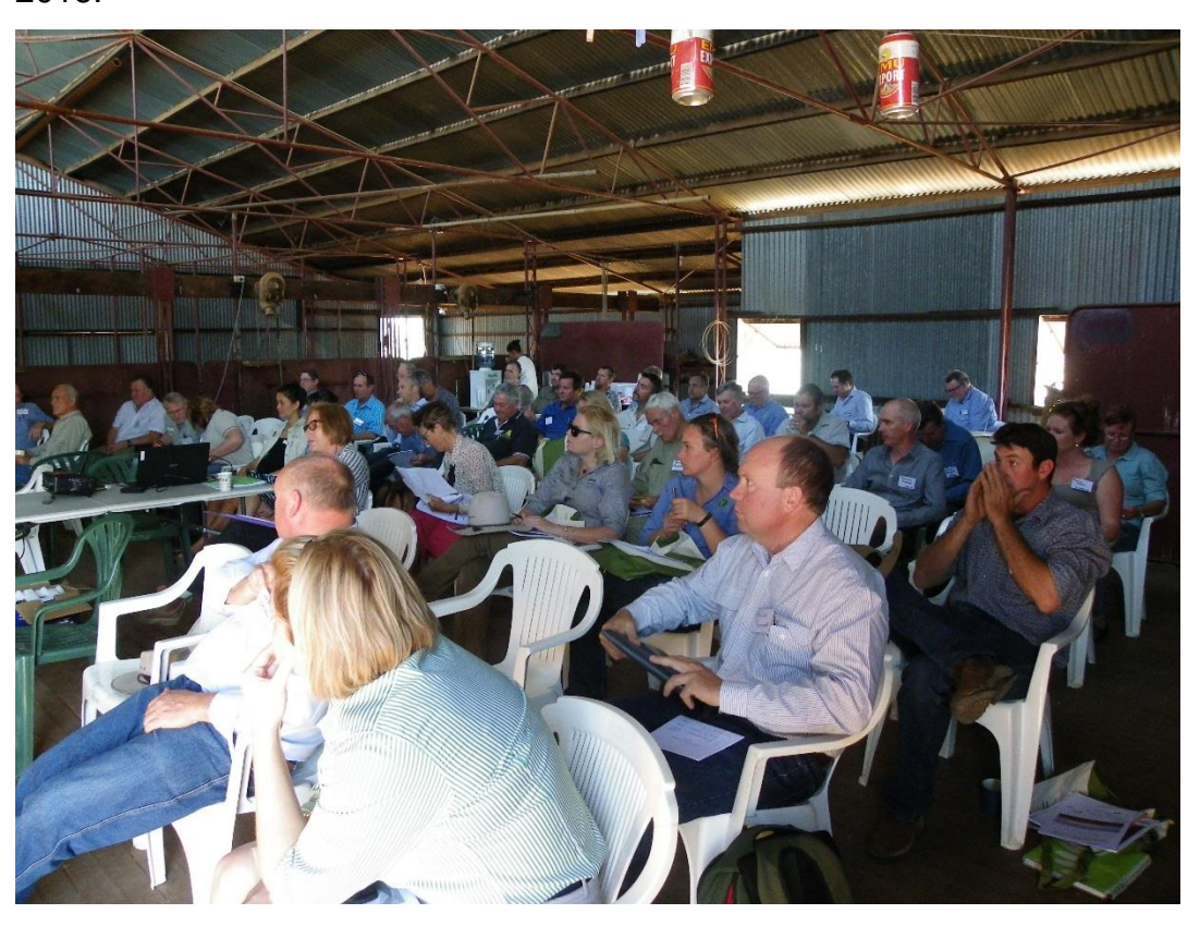
Pastoral Profit Workshop Wogarno Station - October 2015

With funding provided by the Australian Wool Industry (AWI) and the Meat and Livestock Association (MLA) the MRBA assisted in the coordination and promotion of two workshops focusing on business planning and livestock production. These workshops were held at Wogano Station in October 2015 and Nallan Station in May 2016.