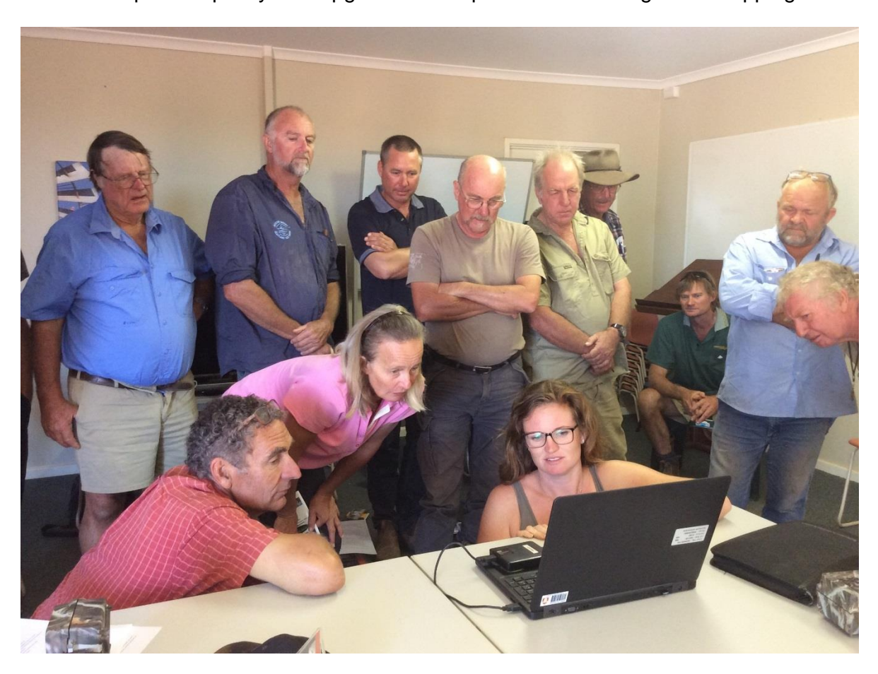
Photo: CRBA LPMTs and pastoral members received training from Dr Tracey Kreplins on setting and using field motion sensor cameras, and are being shown images of wild dogs captured by cameras in the Meekatharra RBA area. (Photo: Bill Currans)