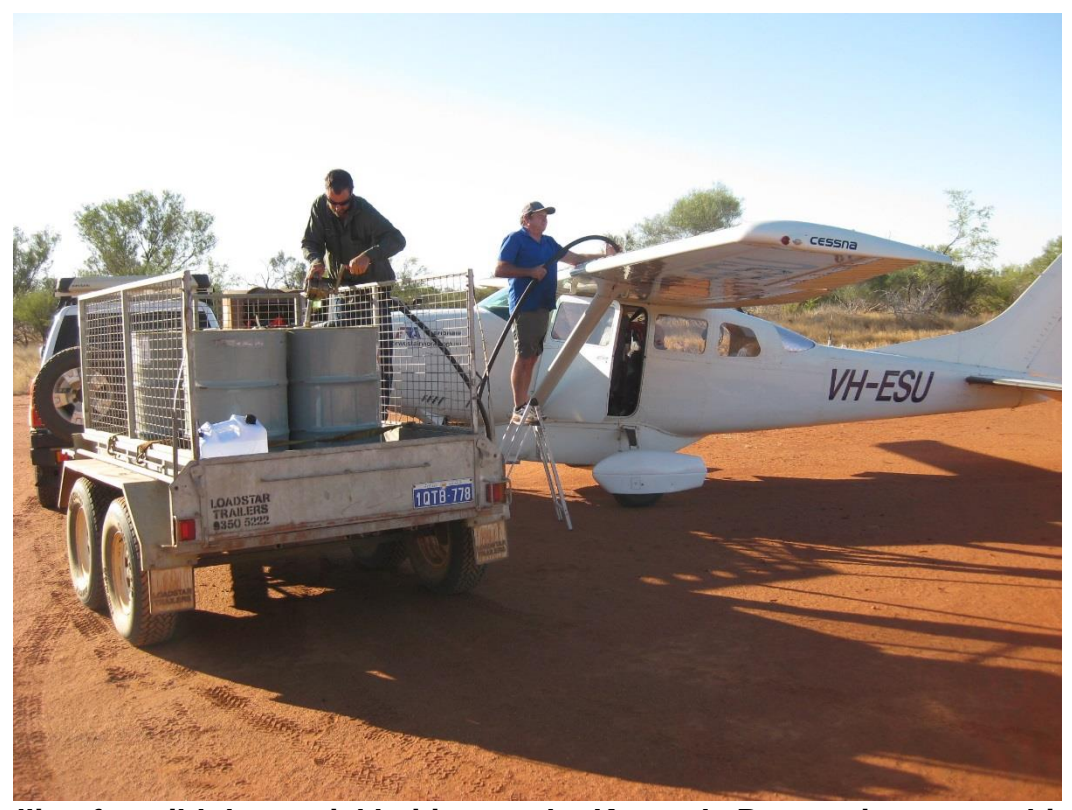
Refuelling for wild dog aerial baiting on the Kennedy Ranges in partnership with the Department of Parks and Wildlife