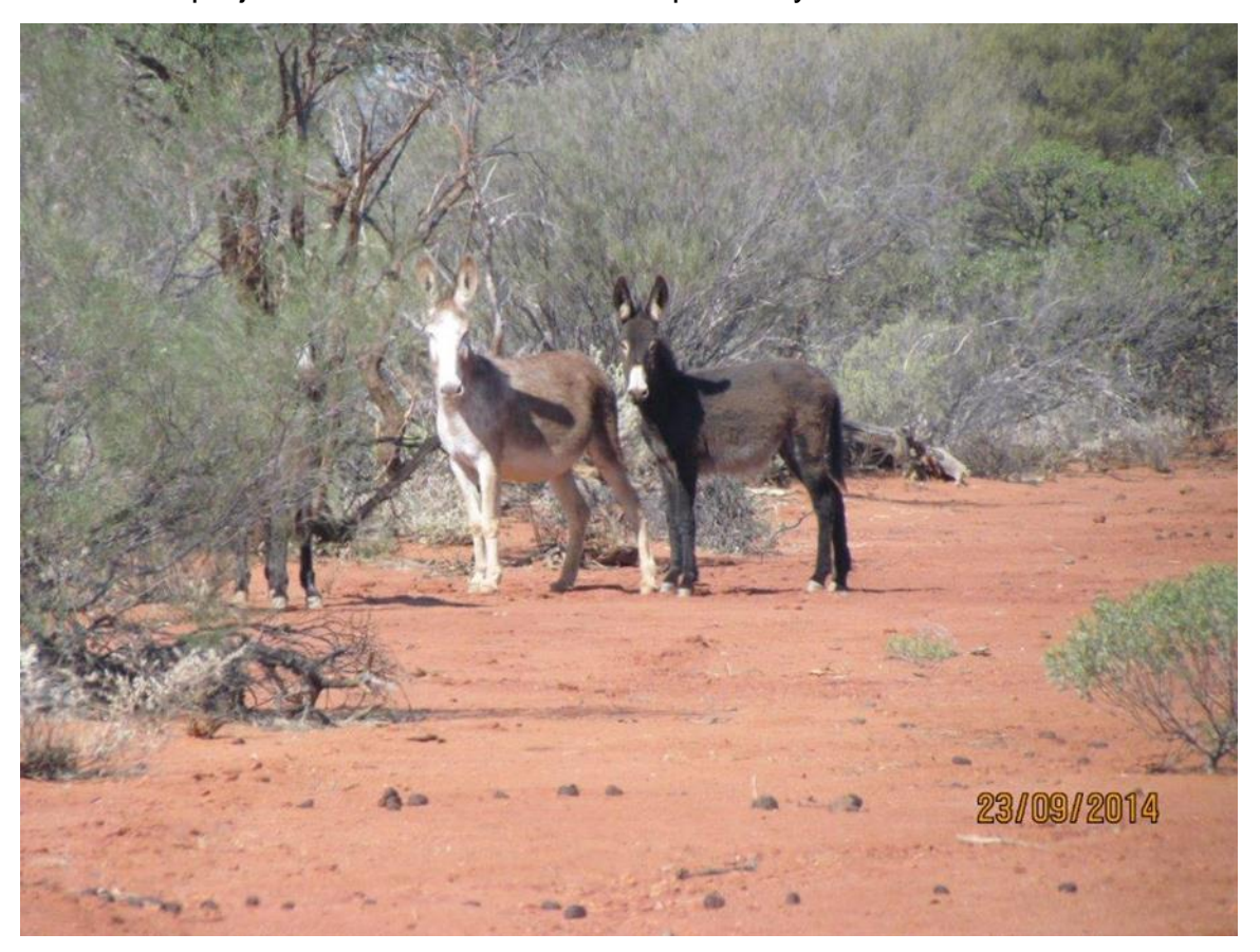
Feral Donkeys on Kalli Station

Both these project are scheduled to be completed by December 2017.