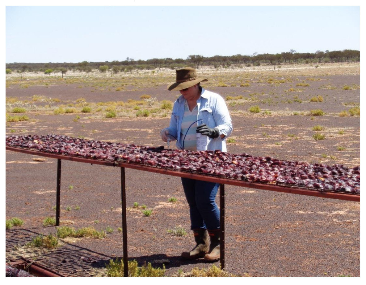
Illgararie Bait Racks

The MRBA community baiting program operates on the basis that a co-ordinated approach, where all pastoralists lay baits within the same time frame, is a fundamental component of a successful wild dog reduction program. Further details of the community baiting program are contained in the MRBA Wild Dog Management Plan which is available on request.