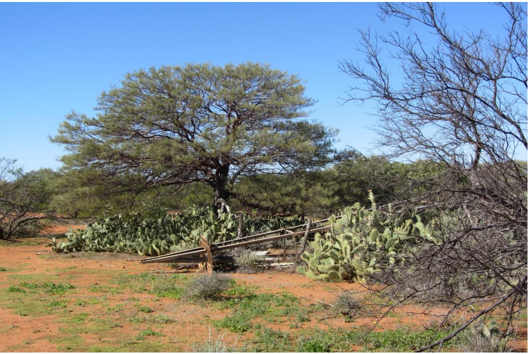
Opuntia engelmannii – Old Woogalong Homestead