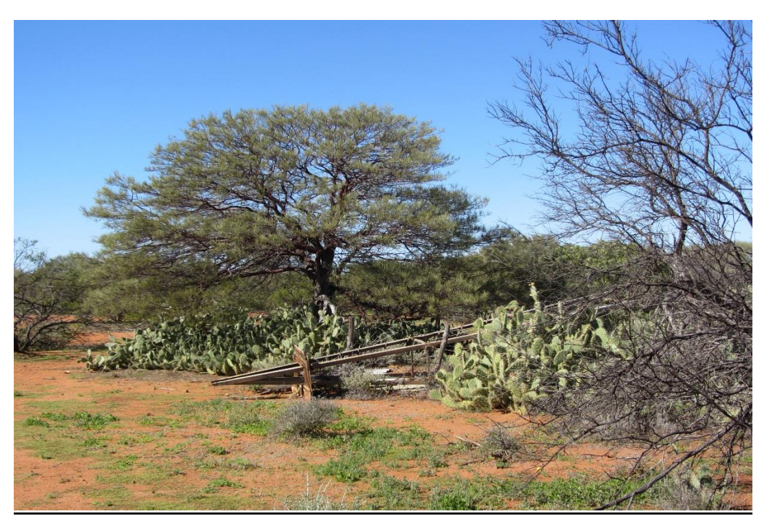
Opuntia engelmannii – Old Wooalong Homestead

headwaters of the Greenough River. The mapping was completed in April 2019 and spraying of the infestation is in progress.