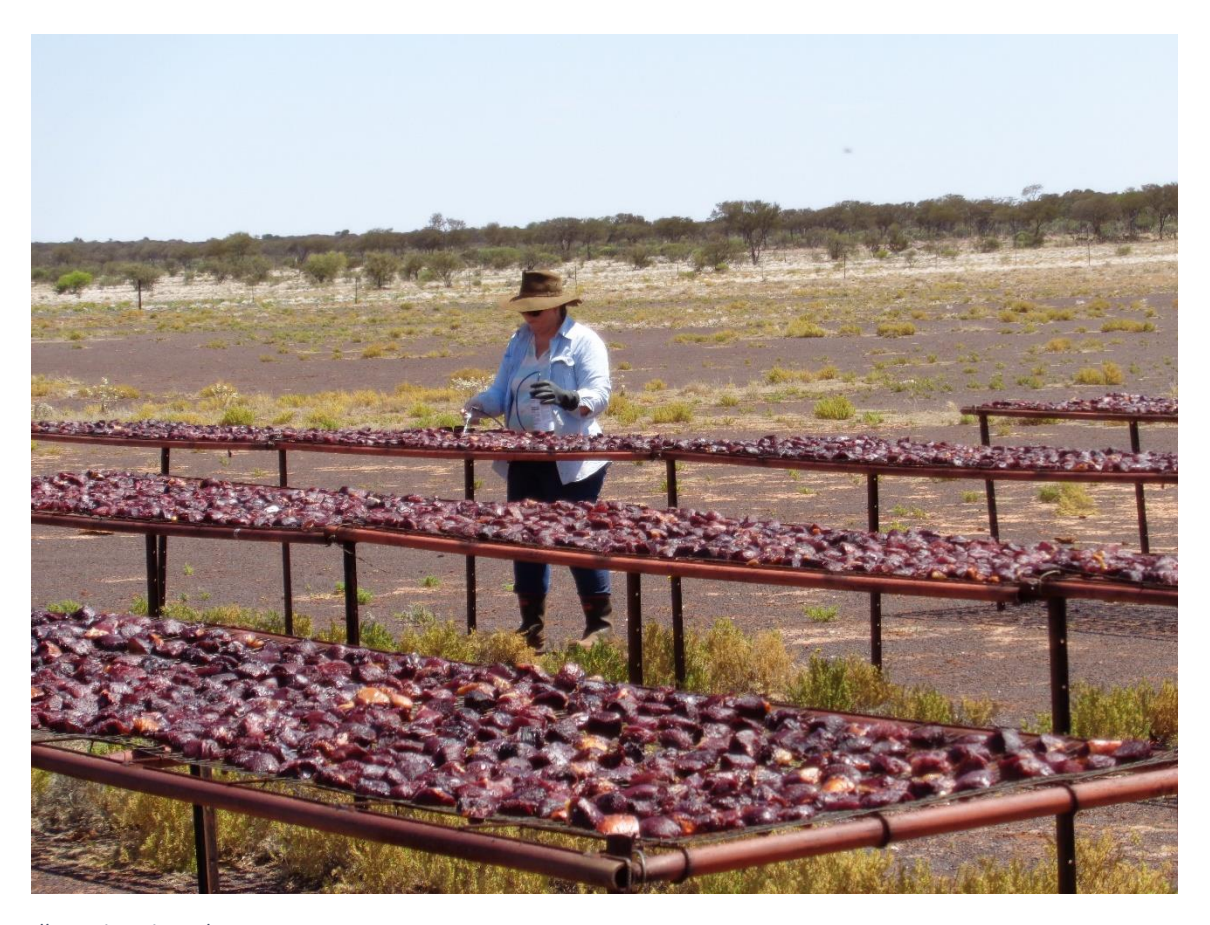
Illgararie Bait Racks

The MRBA community baiting program operates on the basis that a co-ordinated approach, where all pastoralists lay baits within the same time frame, is a fundamental component of a successful wild dog reduction program. Further details of the community baiting program are contained in the MRBA Wild Dog Management Plan which is available on request.