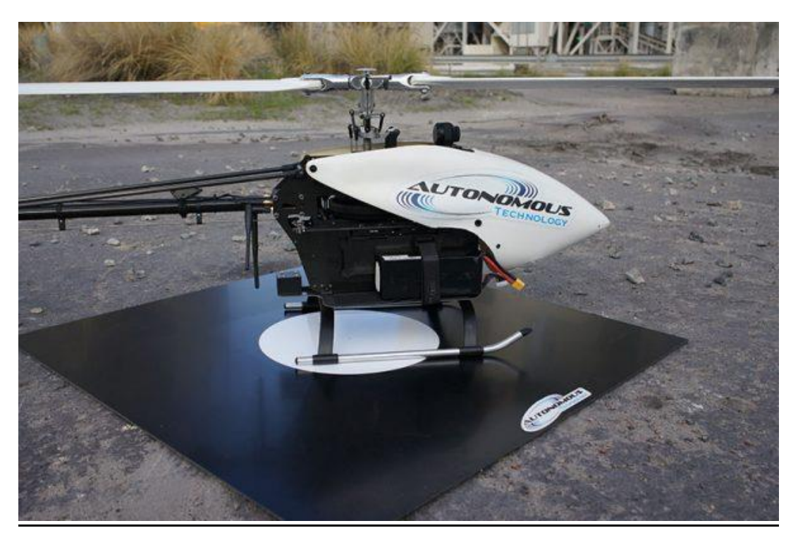
The drone used for mapping at Jingemarra Station