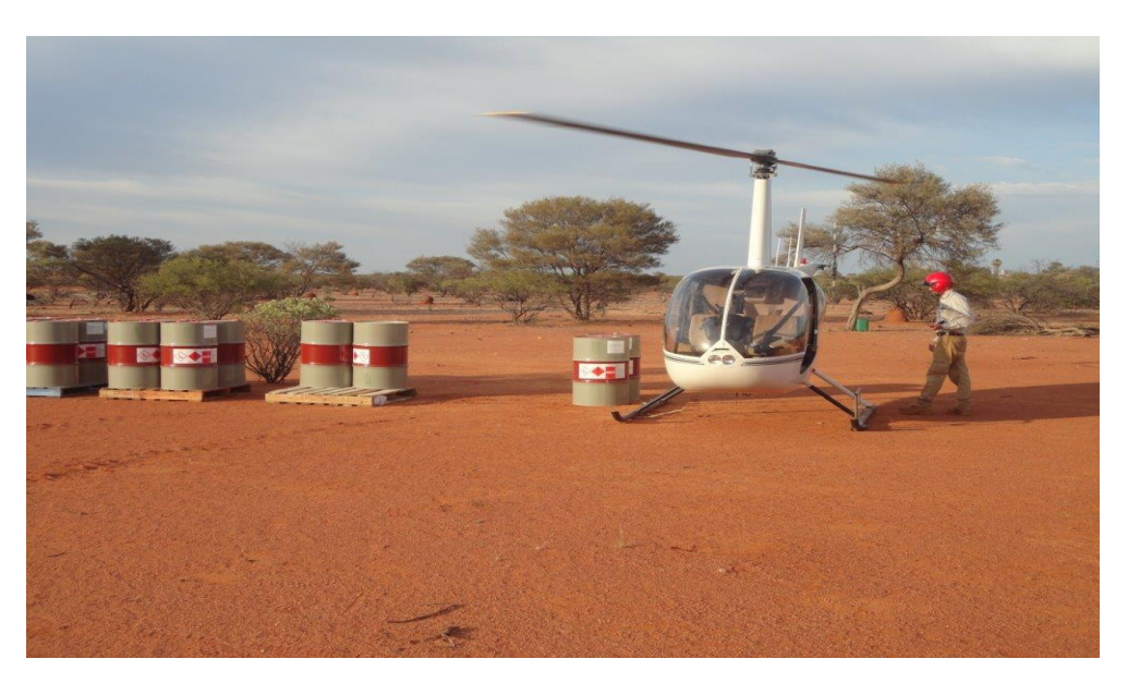
Refuelling at Meka Station

MRBA culls are carried out in accordance with the Invasive Animals CRC Model Code of Practice for the Humane Control of LFHs.