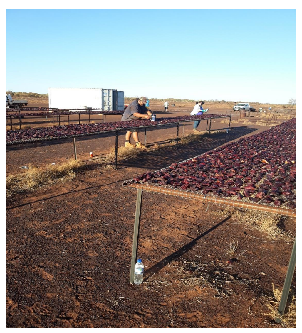
Illrararies Bait Racks

The MRBA community baiting program operates on the basis that a co-ordinated approach, where all pastoralists lay baits within the same time frame, is a fundamental component of a successful wild dog reduction program. Further details of the community baiting program are contained in the MRBA Wild Dog Management Plan which is available on request.