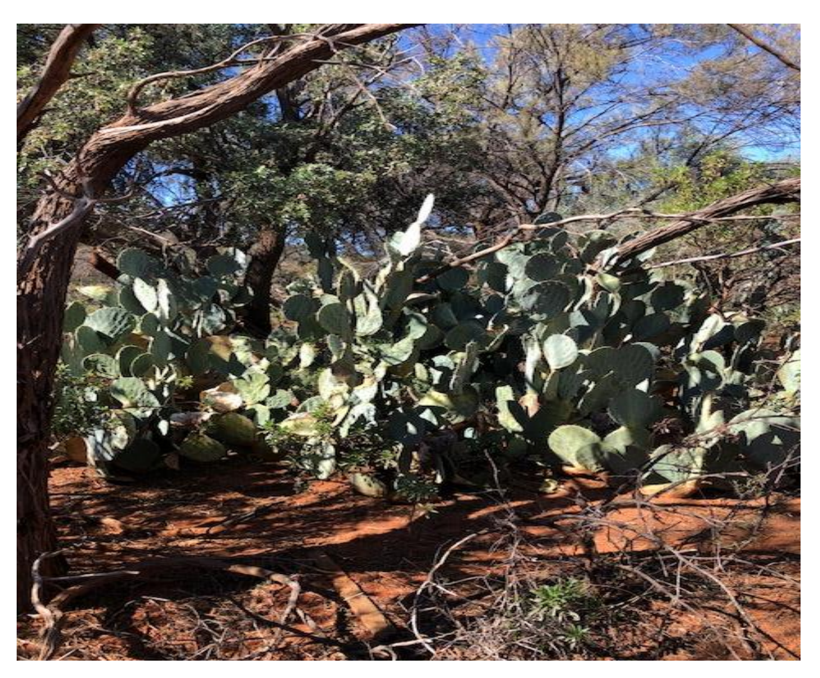
Cactus Infestation – Yandil - Paroo Station

1. A State NRM grant for $12,000 for the mapping and spraying of an infestation of cactus on Paroo Station.