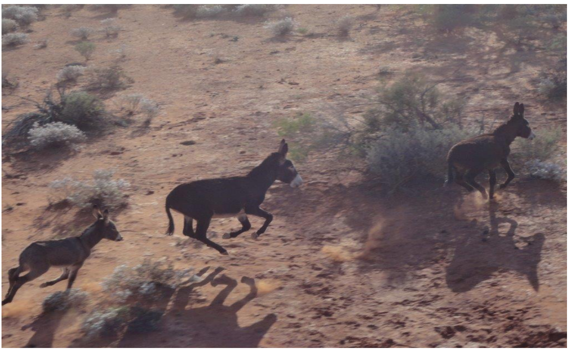
LFH Aerial Control

MRBA culls are carried out in accordance with the Invasive Animals CRC Model Code of Practice for the Humane Control of LFHs.