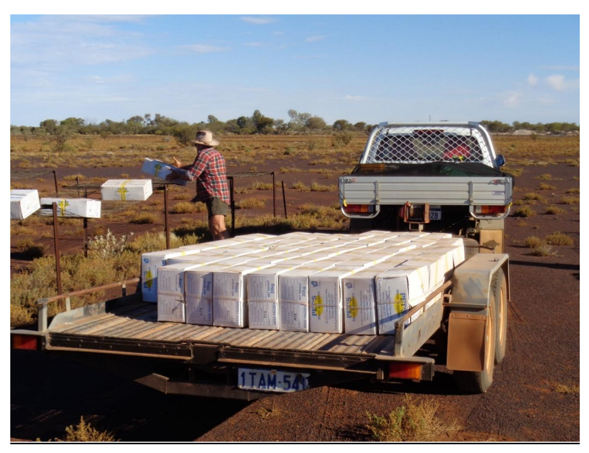
Delivery of Bait Meat - Illgararie

fundamental component of a successful wild dog reduction program. Further details of the community baiting program are contained in the MRBA Wild Dog Management Plan which is available on request.