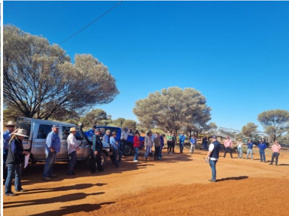
GNRBA AGM Field Day Mt Vettters 2023