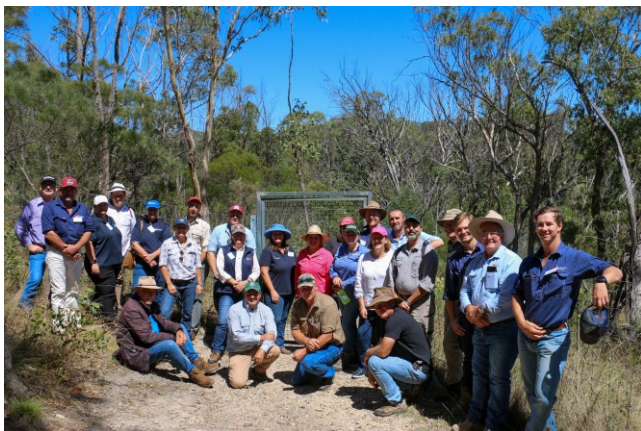
Wild Dog Symposium Armidale NSW

A trip along the Eyre Highway in May 2023 to establish detail of onion weed extent in that region.