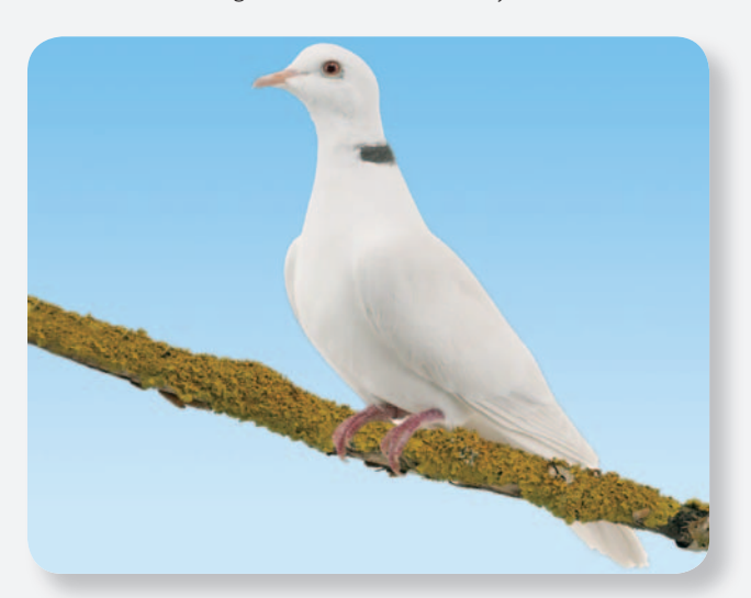
Figure 5. Release of doves outside, like this white-coloured domestic form, is usually illegal.

In South Australia Barbary doves have been regularly sighted for a number of years. For example, in 2009 there were fifteen reports involving 110 birds from twelve suburban locations north and south of Adelaide. The doves have also successfully bred in suburban gardens around the city.