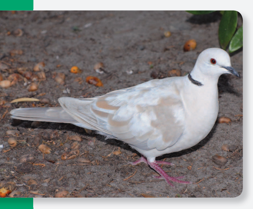
Figure 2. Domestic forms of the Barbary dove are generally white or light-coloured, or mottled white and brown.

Barbary dove calls include a soft ku-k'rroo and a high-pitched excited heh-heh-heh , sounding like a jeering laugh.