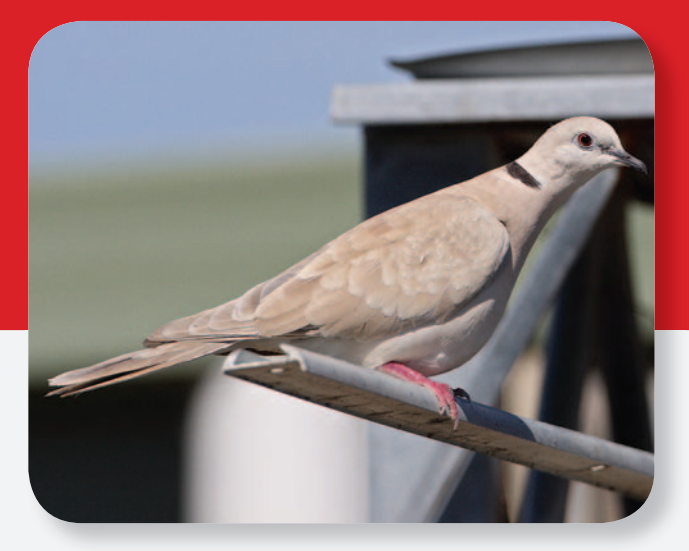
Figure 3. Escaped Barbary dove sighted in a Melbourne suburb.

more frequently in New South Wales and South Australia (Figure 3).