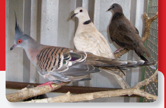
Figure 6. A Barbary dove (centre) found in the wild in Karratha, Western Australia, in the custody of a carer along with a crested pigeon (left) and a spotted dove (right) (photo: Brett Lewis, Department of Environment and Conservation, Western Australia).

In Victoria Barbary doves have been infrequently reported since the late 1990s and may also occasionally breed in gardens. In early 2010 a small breeding group of about twelve birds was removed from an inner suburb of Melbourne and a pair was sighted in the suburb of Brighton. The most recent report is a small breeding group located at Rutherglen, north-east of Melbourne, which authorities plan to remove.