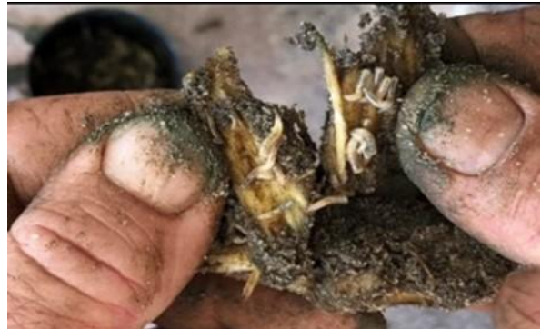
Larvae in celery stump. The number of larvae in this small piece of celery multiplied over a field of waste celery stumps has the potential to produce over 100,000 stable flies

If I find larvae - follow the control methods below.