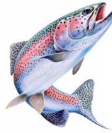
Rainbow trout ( Oncorhynchus mykiss )

* Please note, most species of native freshwater fish including Balston's pygmy perch, black-stripe minnow, little pygmy perch, mud minnow, western trout minnow, pouched lamprey, and salamanderfish are totally protected and cannot be taken.