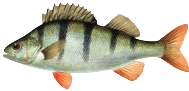
Redfin perch – pest species ( Perca fluviatilis )

Do not return pest species such as carp, redfin perch and goldfish to the water, it is recommended that they are humanely euthanised and disposed of.